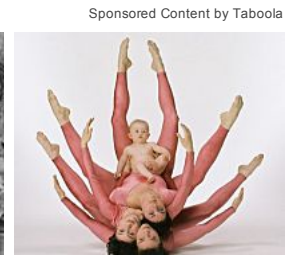
20 Mortifying Family Photos